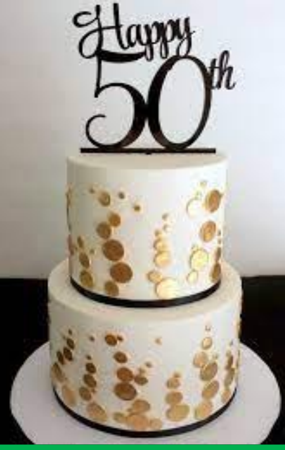
What Happened in 1973?

'Tie a Yellow Ribbon' was the biggest hit of the year.